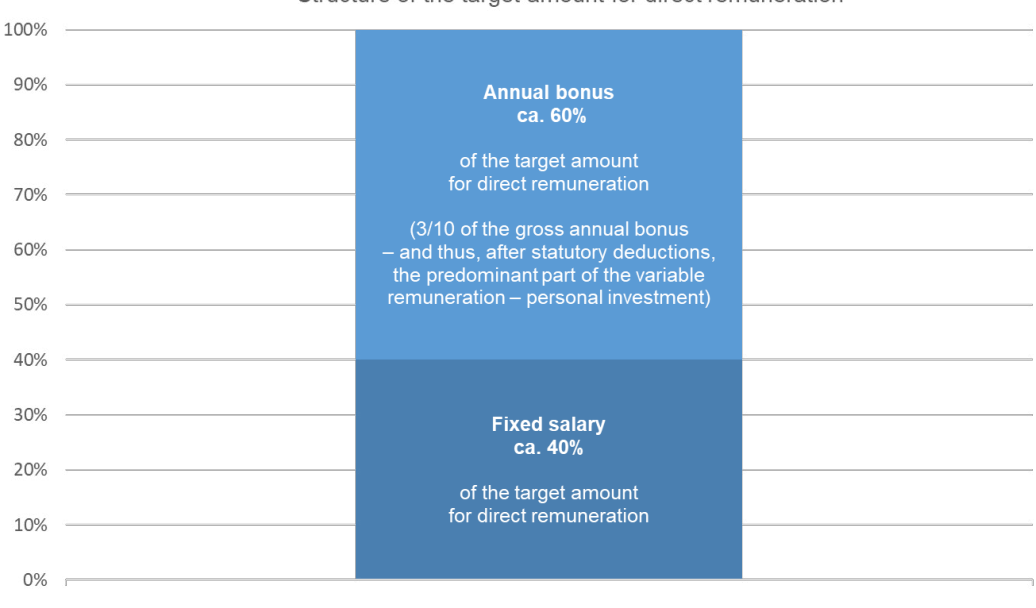
Figure 1: Structure of the target amount for direct remuneration

The chart below shows the percentage shares of the fixed salary and the target amount for the annual bonus in the total target amount for direct remuneration.